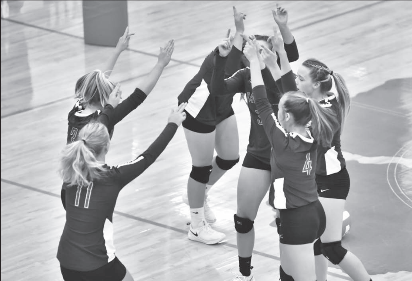
Union County volleyball knocked off Washington-Wilkes last week to clinch a spot in the upcoming Class AA State Tournament. They would later fall to Lake Oconee Academy to set up a consolation game match with Oglethorpe County at Rabun County High School. Oglethorpe would jump out front 15-4 before eventually taking game one 25-19. Union answered with a 25-22 win in game two then led 17-13 in game three before the Lady Patriots rallied for a 25-19 victory to take third in Region 8-AA. The Lady Panthers finish fourth.