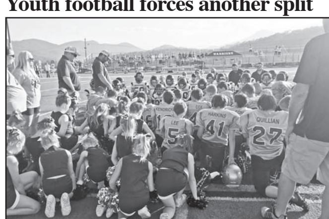
Union prays following a game earlier this year.